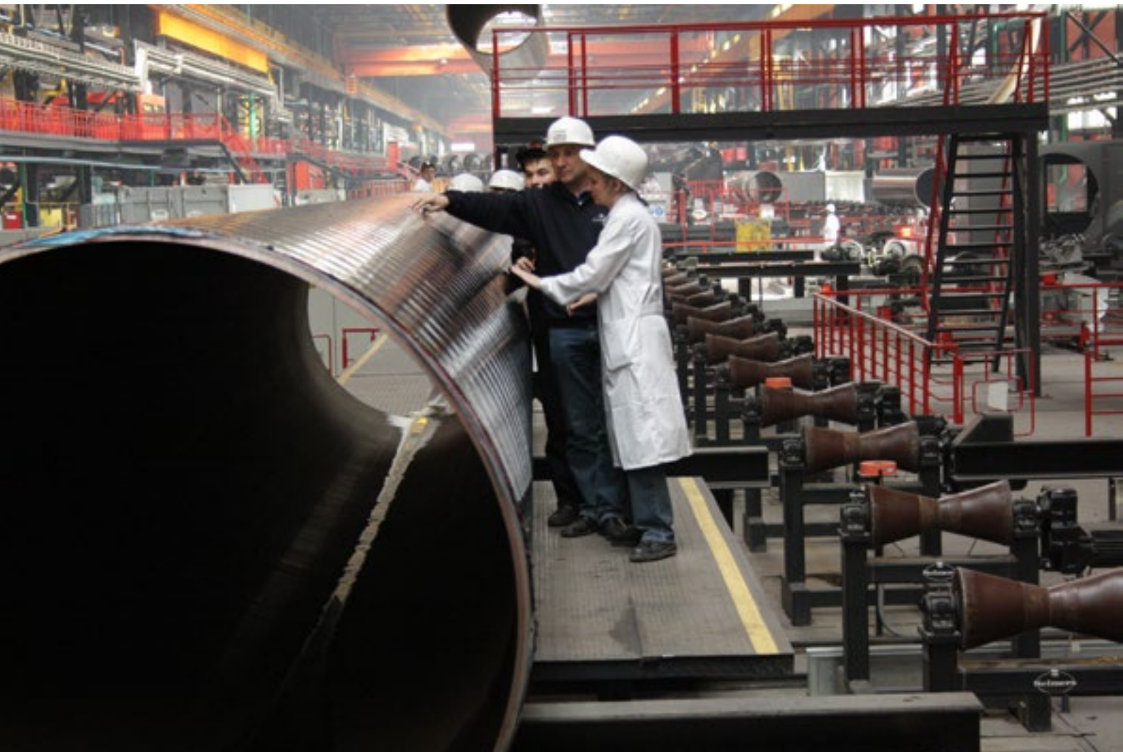
Coating quality inspection

Selmers manufactures equipment to apply any type of coating material, in compliance with international standards such as DIN, AWWA, BS, ASTM, CEN, ISO, GOST or customer specifications.