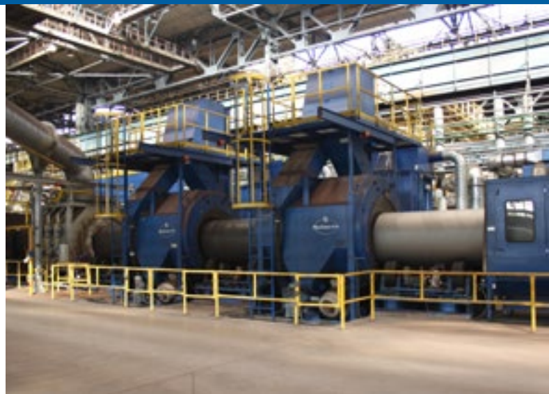
External blasting line