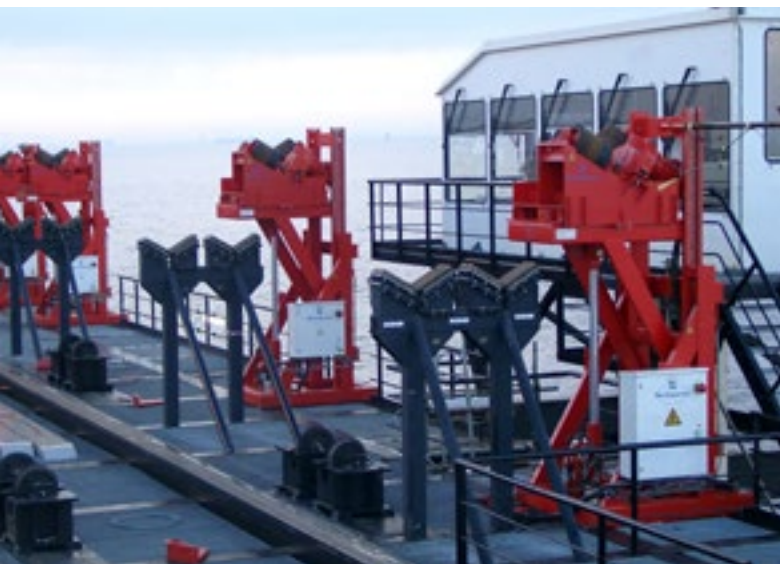
Offshore pipe handling equipment