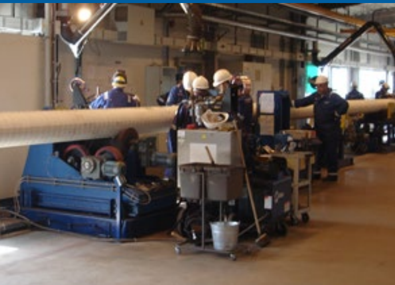
Spool base – Multi jointing line