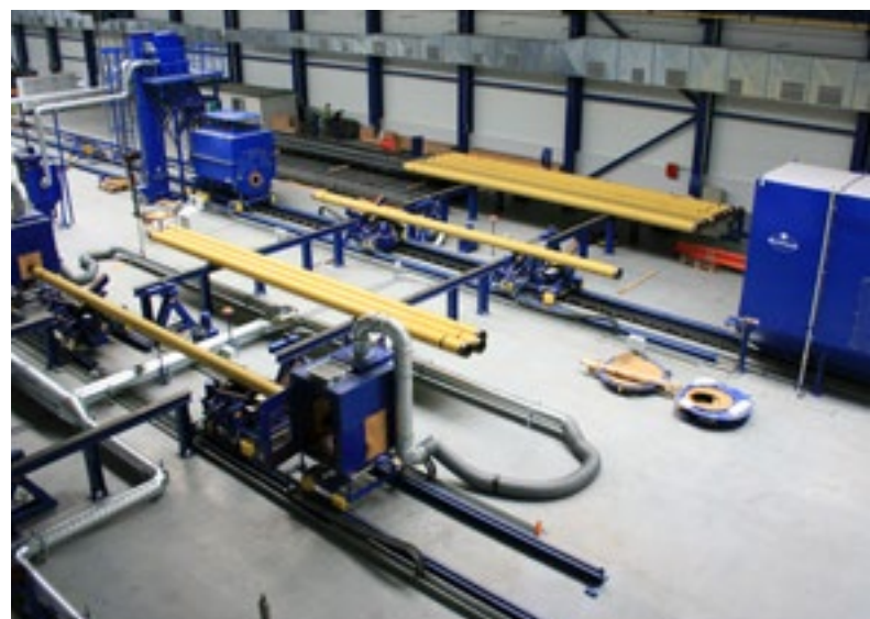
Internal blasting and coating station