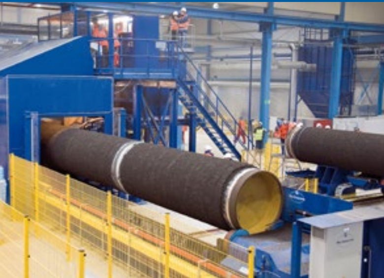
Concrete weight coating - application unit