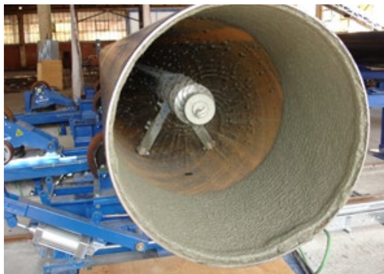
Cement mortar lining installation