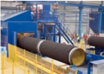
Concrete weight coating