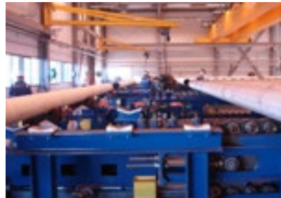
Spool base equipment