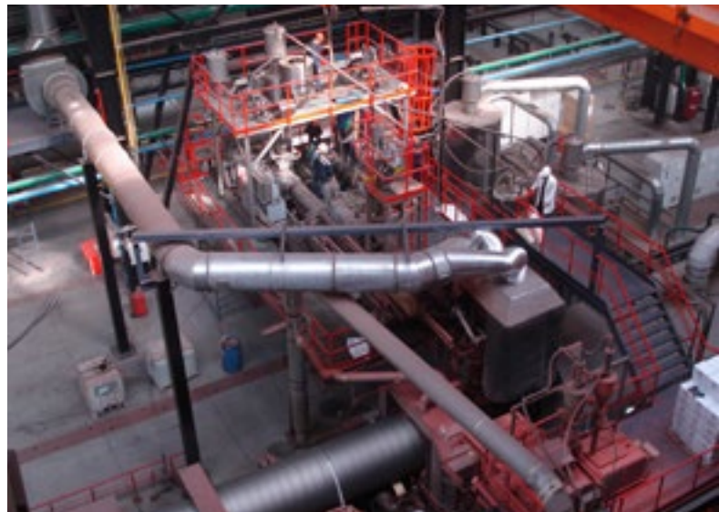
External FBE & 3LPE coating line