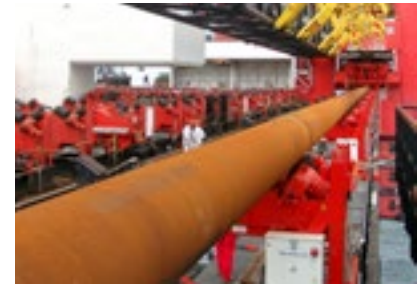
Offshore pipe handling