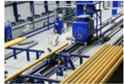
Internal blasting & lining